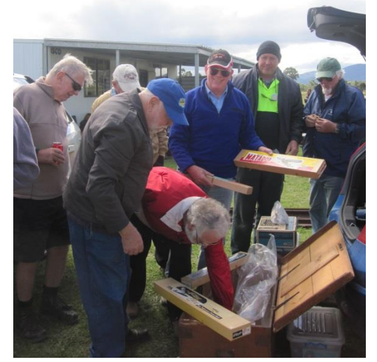
And an old AM 15 but then there were the kits .........

I collected a few treasures like this Mills 1.3 diesel from about 1947 UN-RUN!