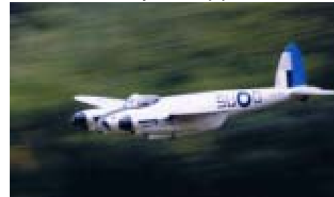
Graeme Swalwell's Mosquito

Just to whet your appetite, here are a few: