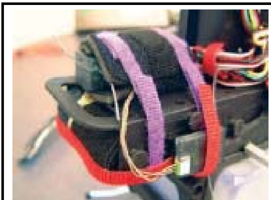
AR7000 installed in a helicopter. Main receiver is mounted in the normal location. Remote receiver has Velcro on its back and is stuck to Velcro straps holding main receiver in place. Note perpendicular orientation of the two antennas.

Also, as the aircraft goes through different orientations when performing aerobatics, there's always one antenna that is going to see the transmitter signal for a solid lock. However, as the model size grows, so does the chance of large objects in the model blocking the signal to the tiny receiver box and antennas.