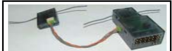
AR7000 receiver(s) with short pigtail connecting the two discrete receivers. The remote receiver should be at least 2 inches from the main receiver with the antenna oriented perpendicular to the main receiver’s antenna.

Another problem with using signals at 2.4 GHz is that the antenna orientation can become critical. By employing a separate antenna for each receiver, and orienting them 90° to each other, they see around the various objects in the aircraft differently.