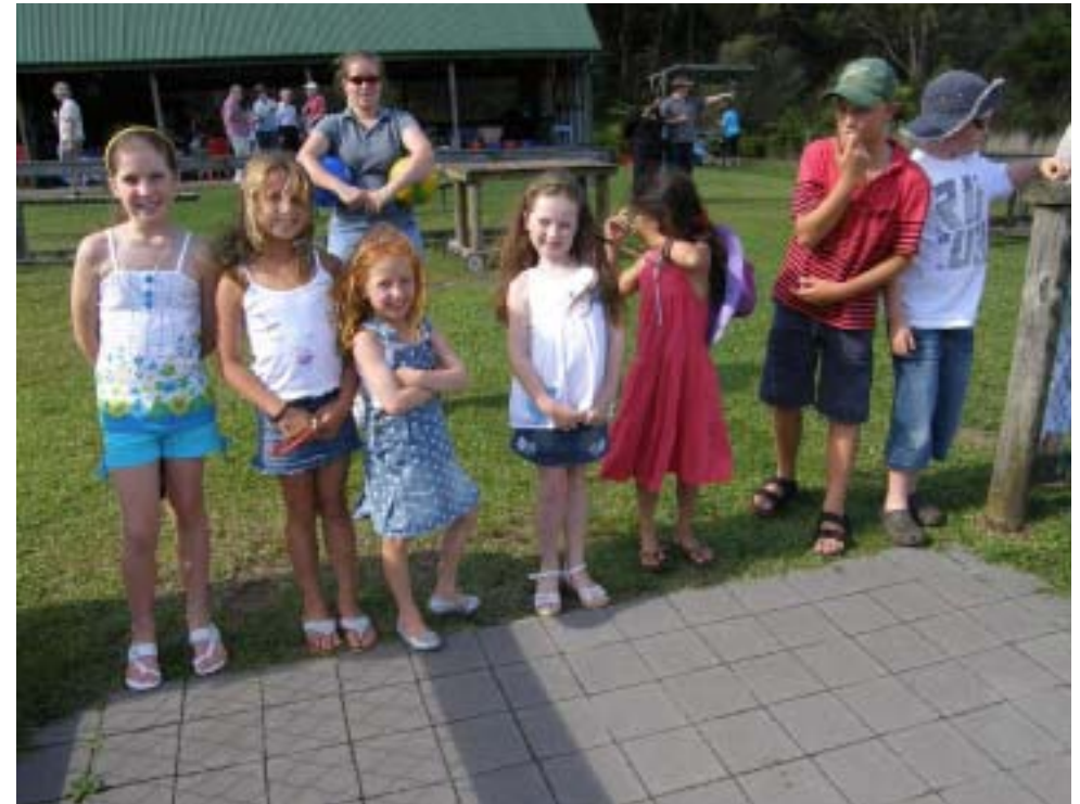
The children get ready to greet Santa at the Christmas Party

MEETINGSMEETINGSMEETINGSMEETINGSMEETINGS