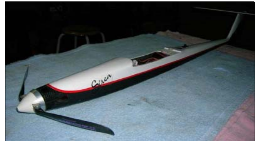
The length of the cowl of the Siren fuselage made for difficulties in installing the motor ( see article)

The siren is an ARF kit produced by Great Planes, which falls into the class of a HOTLINER. A hotliner is the soaring enthusiast's version of a "heart starter".