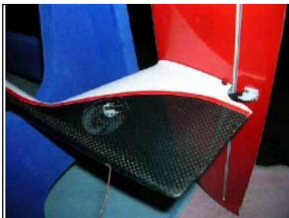
Demonstrating the position of the servo for the elevator for the Siren

The motor did however prove difficult to install, as access to the firewall with a long narrow fuselage requires patience and